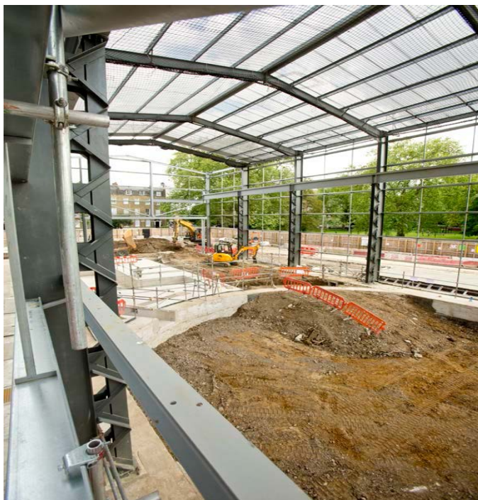
The acoustic enclosure under construction

Excavation of the shaft will commence during July to an approximate depth of 25m, followed by the tunnel in August. The work will be carried out within the acoustic enclosure, which is due to be removed in spring 2018.