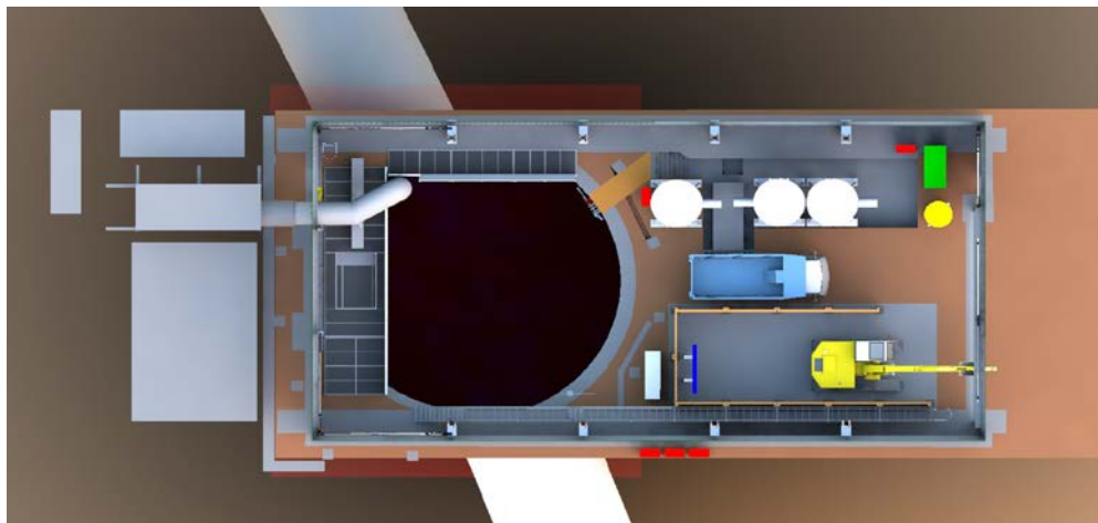
Layout of equipment within acoustic enclosure

From Monday 11 July our working hours will change to 24 hours a day 7 days a week. This will continue until the completion of the shaft and tunnel in 2018.