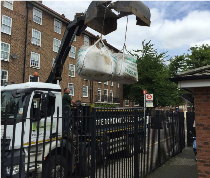
Soil being delivered for the Community Garden at the Rose Centre