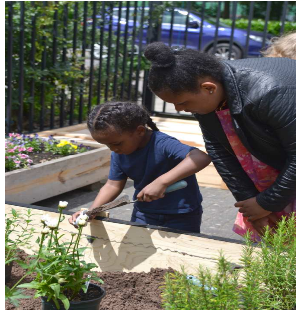
A family putting the soil to good use in the planters donated