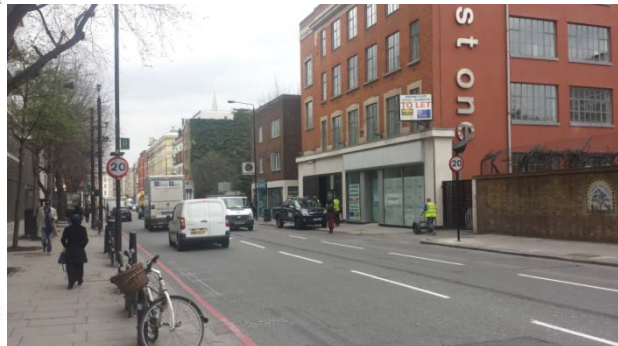
Commercial Street 20mph speed limit