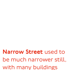
Cranes, Millwall Dock

Millwall Dock – The name originates from seven windmills that used to stand on the western side of the Isle of Dogs. They disappeared in the early 19th century with the arrival of steam engines.