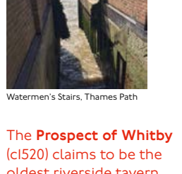
Watermen's Stairs, Thames Path

Limehouse Basin links Regent's Canal and the River Thames, and was used by seagoing vessels to offload coals to afloat. At one point the Basin was the principal entrance from the Thames to the entire national canal network.