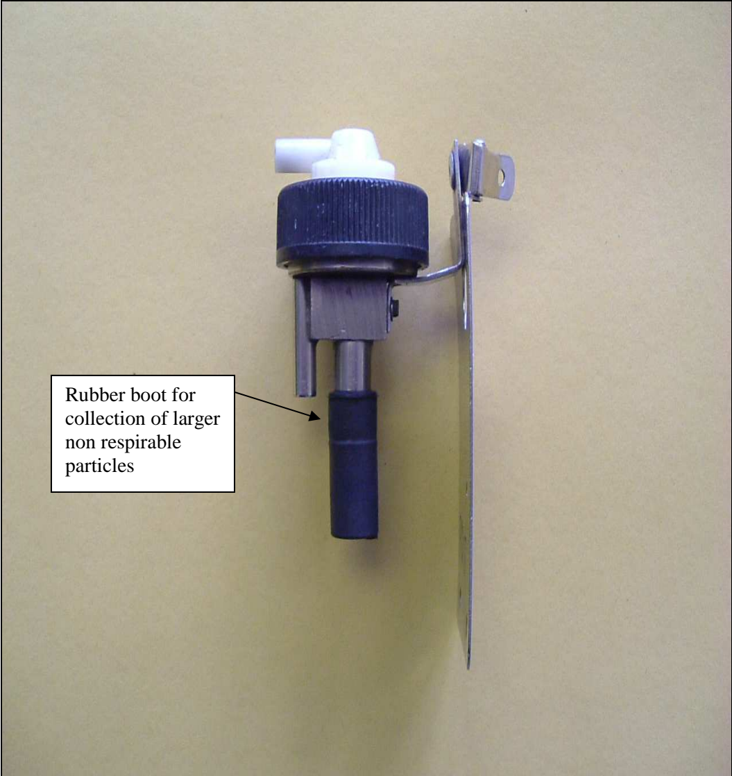
Figure 1 : Cyclone Dust Head