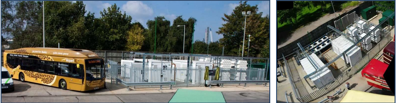
Figure 2: Illustrations of Reading Buses premises.

5.2 Gas from the grid is typically compressed to 200 bar pressure for refuelling which takes up significant space, as shown in the two illustrations of Reading Buses premises in Figure 2. In most operator garages in London, there would not be space for such infrastructure to be installed.