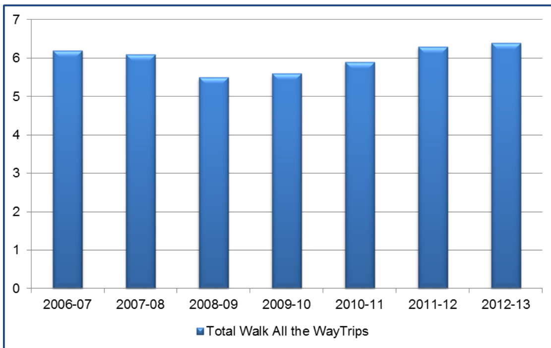
Figure 1 Total daily numbers of 'walk all the way' trips (millions)