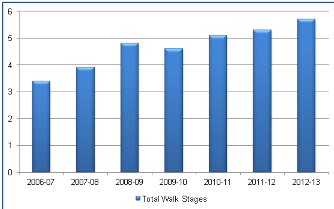
Figure 2 Total daily numbers of walk stages over five minutes excluding ‘walk all the way’ trips (millions)